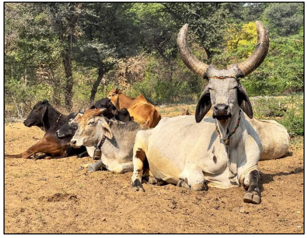
Photo 1. Zebu (Bos indicus) and of the Asian domestic water buffalo (Bubalus bubalis)

improvement in the reproductive health of animals, calf crop numbers will gradually march upwards.