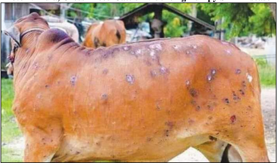
Photo 2. India, Cross Breed Cattle Evidencing Lumpy Skin Disease in 2022.

In 2022, India experienced anew an outbreak of the Lumpy Skin Disease (LSD) in cattle in various parts of the country (see, <u>GAIN-INDIA | IN2022-0066 | Outbreak of Lumpy Skin Disease in Cattle Raises Alarm in Cattle-rearing Communities in the State pf Gujarat and GAIN-INDIA | IN2022-0070 | Update – Lumpy Skin Disease Spreads to Northern States of India).</u>